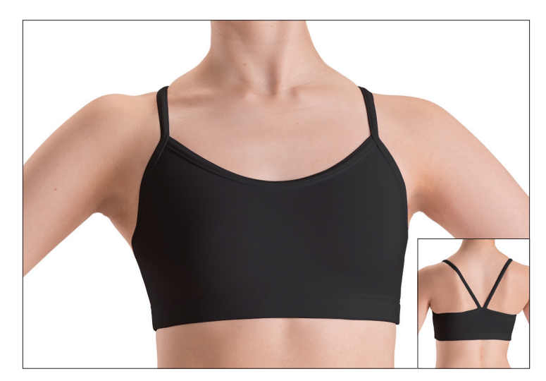
MW3087SS V BACK STRAP CAMI BRA TOP

INT,MC,LC,PA,SA,MA,LA,XLA 497 BLACK SILK SKYN