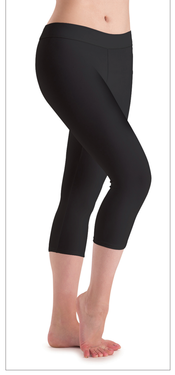
MW7123 FLAT WAIST CAPRI

SC,INT,MC,LC,PA,SA,MA,LA,XLA,1X,2X,3X 497 BLACK SILK SKYN