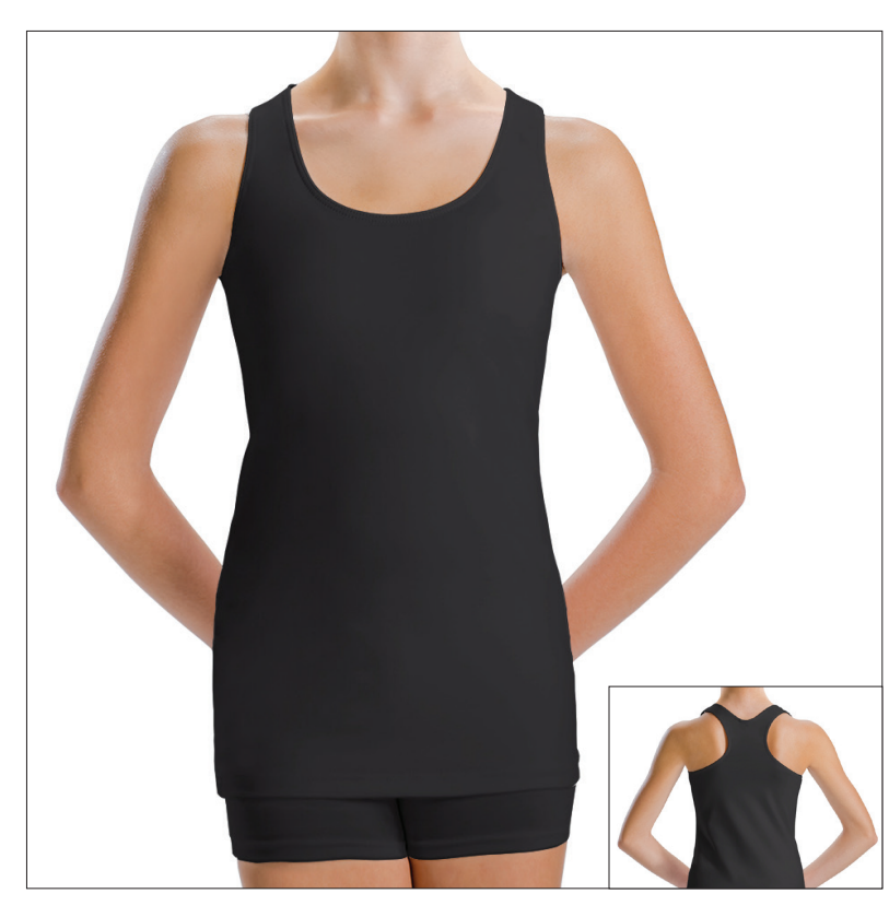
MW3609 RACERBACK EXTENDED LENGTH TANK TOP

SC,INT,MC,LC,PASA,MA,LA,XLA 610 BLACK DRI-LINE, 497 BLACK SILK SKYN