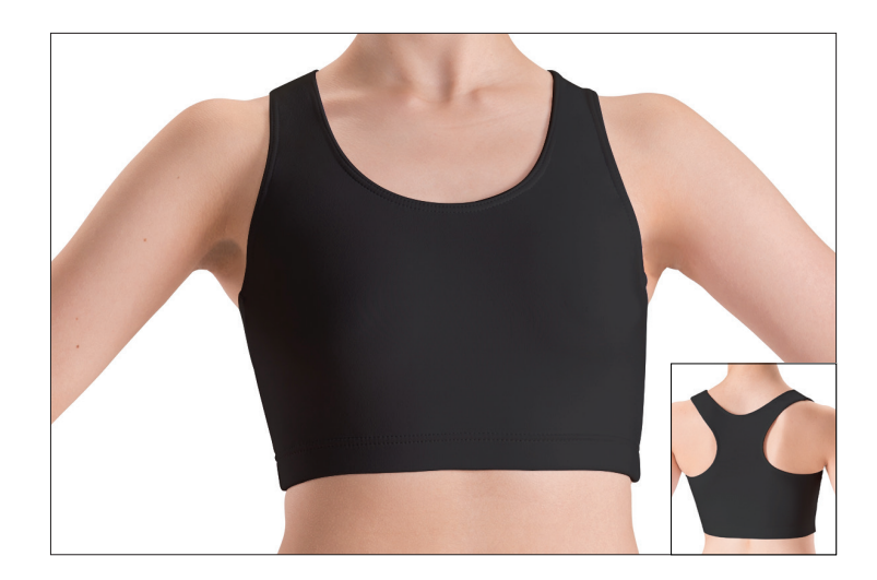
MW3120DL RACERBACK CROP TOP INT,MC,LC,PA,SA,MA,LA,XLA 610 BLACK DRI-LINE