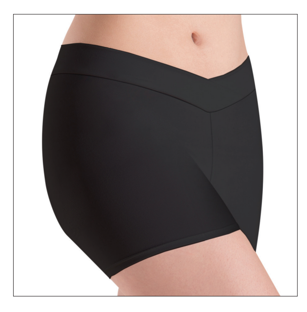
MW7113 V WAIST SHORT

SC,INT,MC,LC,PASA,MA,LA,XLA 610 BLACK DRI-LINE, 497 BLACK SILK SKYN