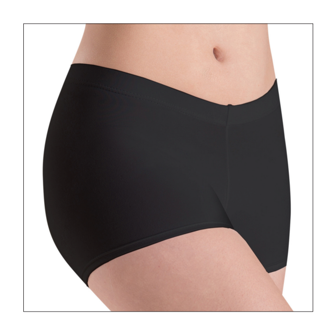
MW 7101 LOW RISE SHORTS

SC,INT,MC,LC,PA,SA,MA,LA,XLA 610 BLACK DRI-LINE, 497 BLACK SILK SKYN