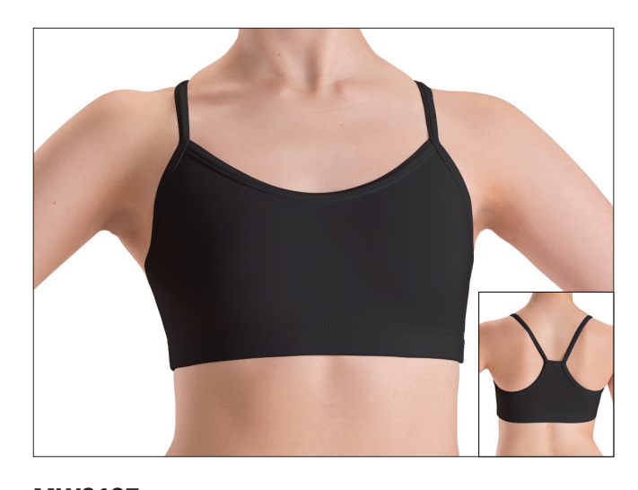
MW3127 RACERBACK CAMI BRA TOP SC,INT,MC,LC,PA,SA,MA,LA,XLA,3X,2X,1X 610 BLACK DRI-LINE, 497 BLACK SILK SKYN