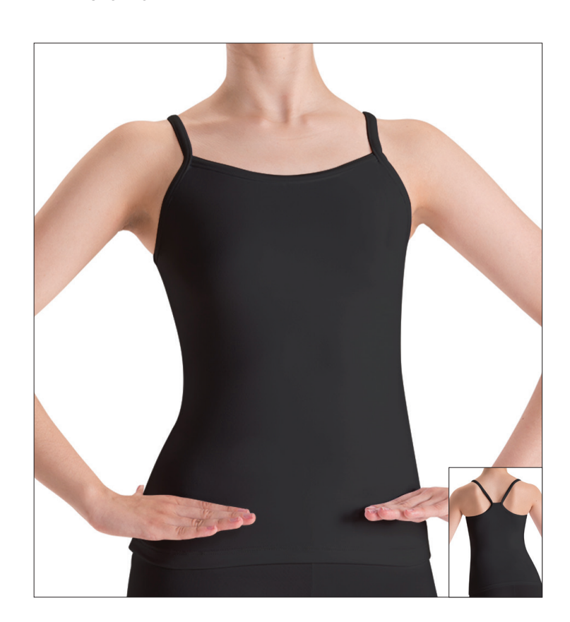
MW3502SS RACERBACK CAMI LONG TOP

INT,MC,LC,PA,SA,MA,LA,XLA 497 BLACK SILK SKYN