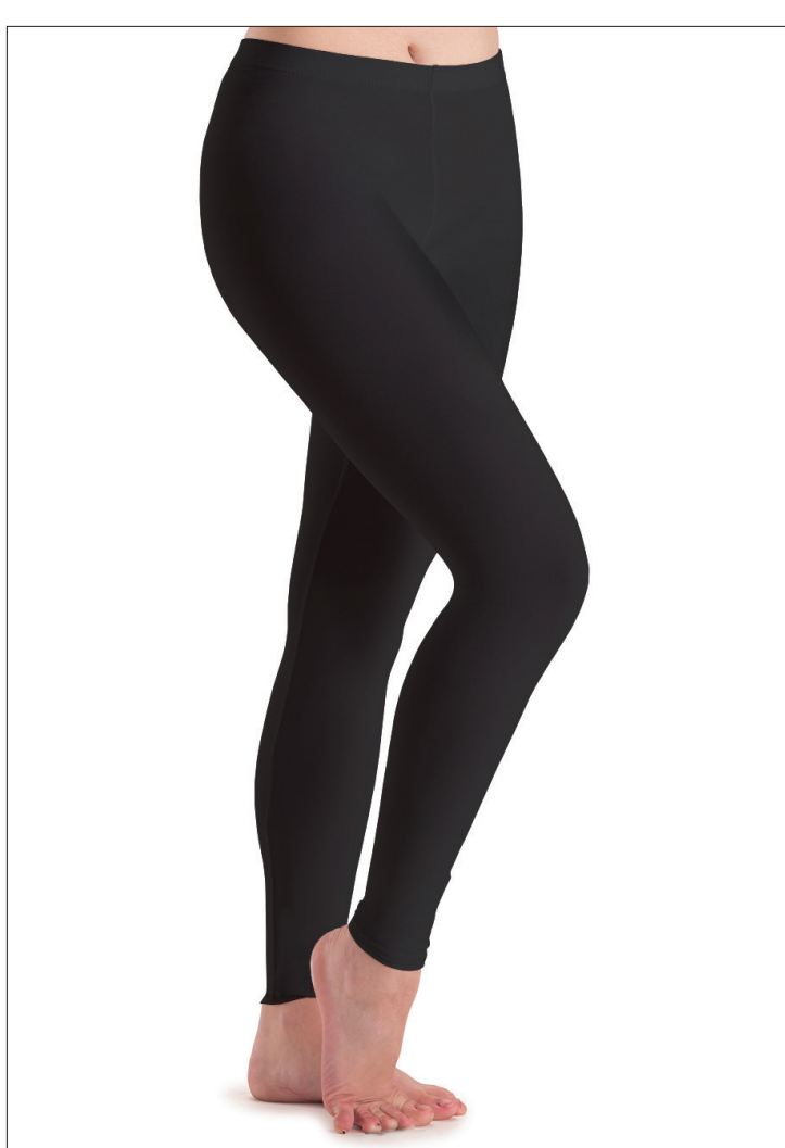
MW7130 ANKLE LEGGINGS